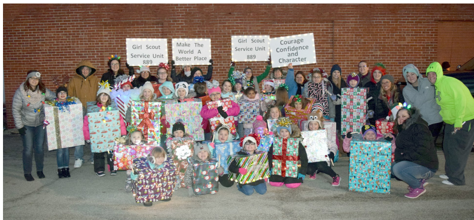
The Girl Scouts were in last year's parade dressed as presents.

It's easy to register yourself for this parade, see insert in this newsletter.